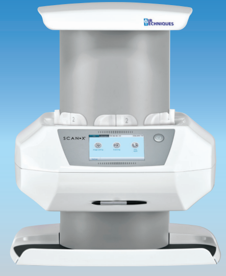
ScanX Intraoral View