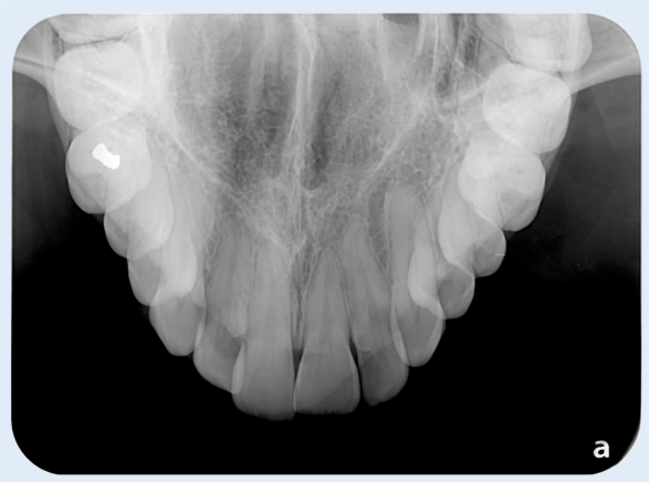
Occlusal - Size 4 PSP