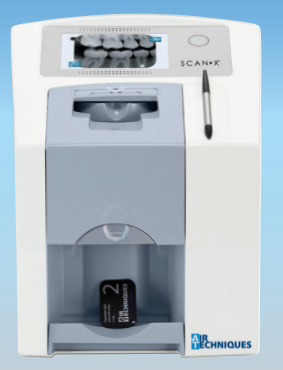
ScanX Swift View